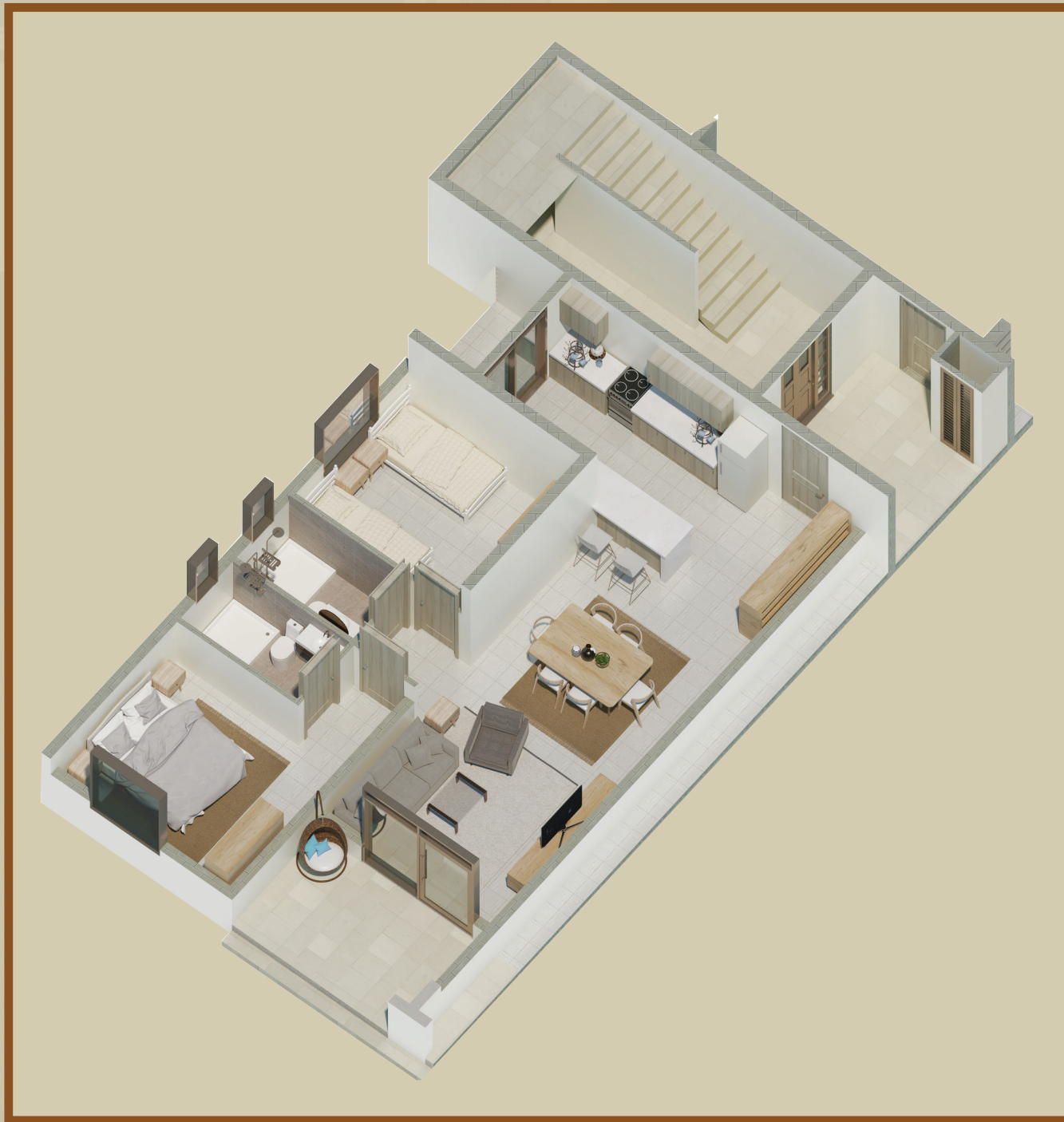
2 BEDROOM FLOOR PLAN