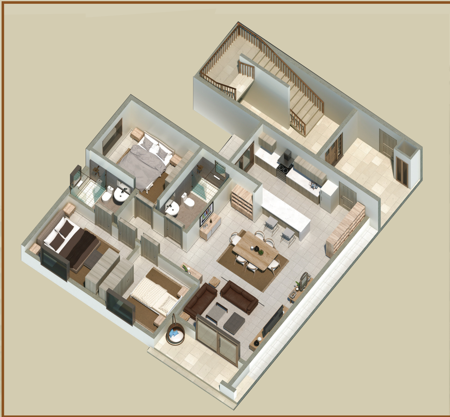
3 BEDROOM FLOOR PLAN