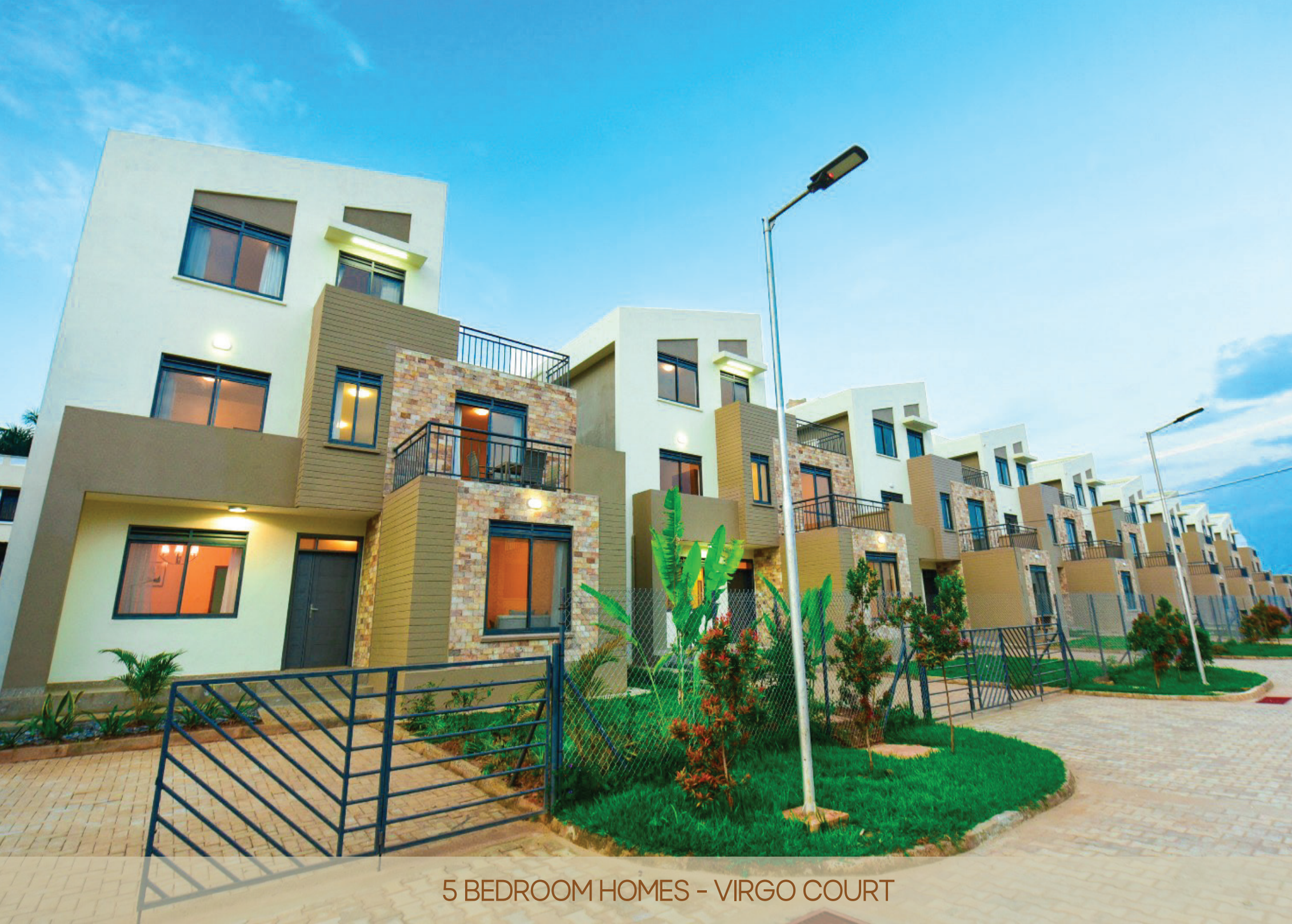
5 BEDROOM HOMES - VIRGO COURT