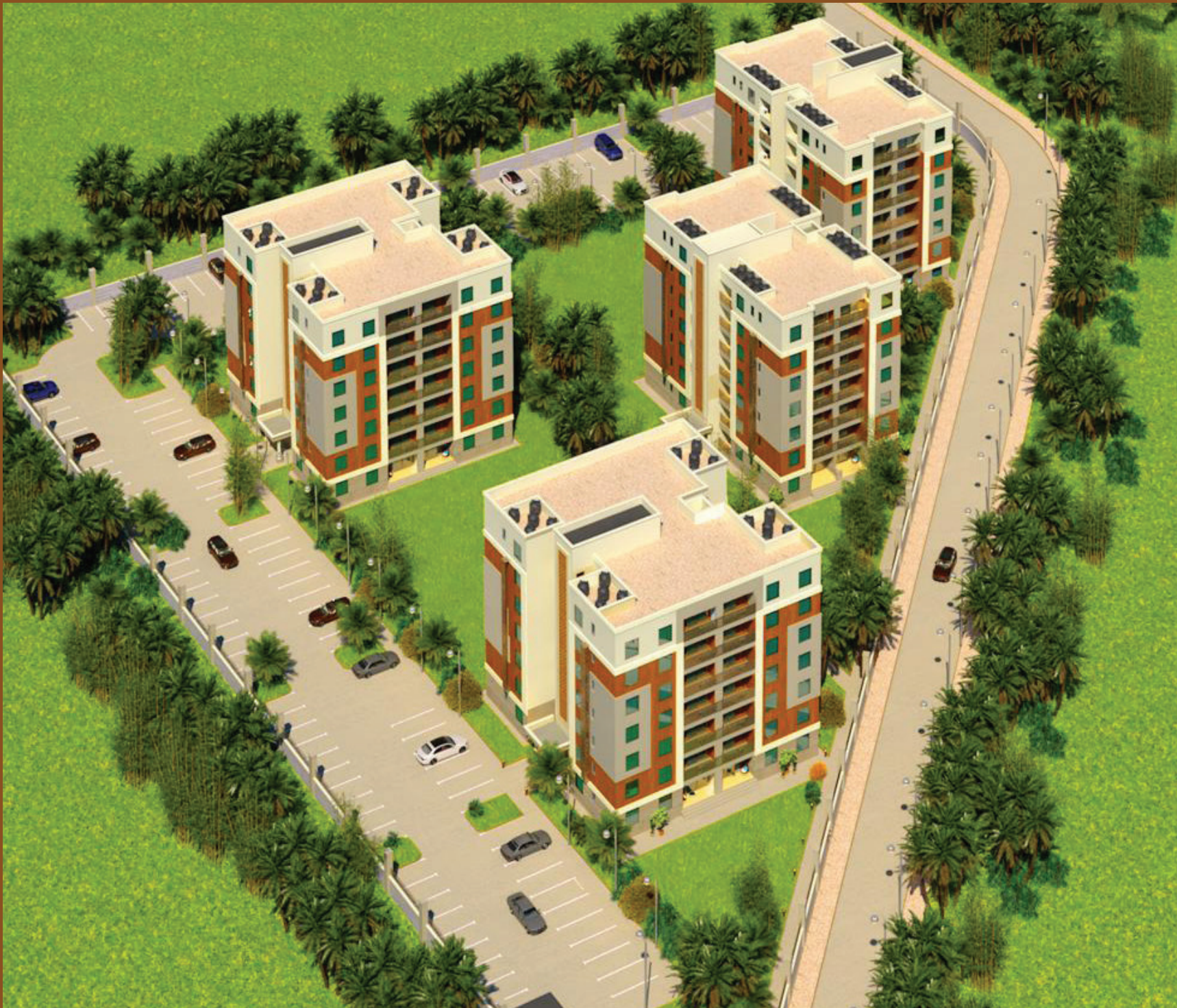
AERIAL VIEW OF THE GARDENS