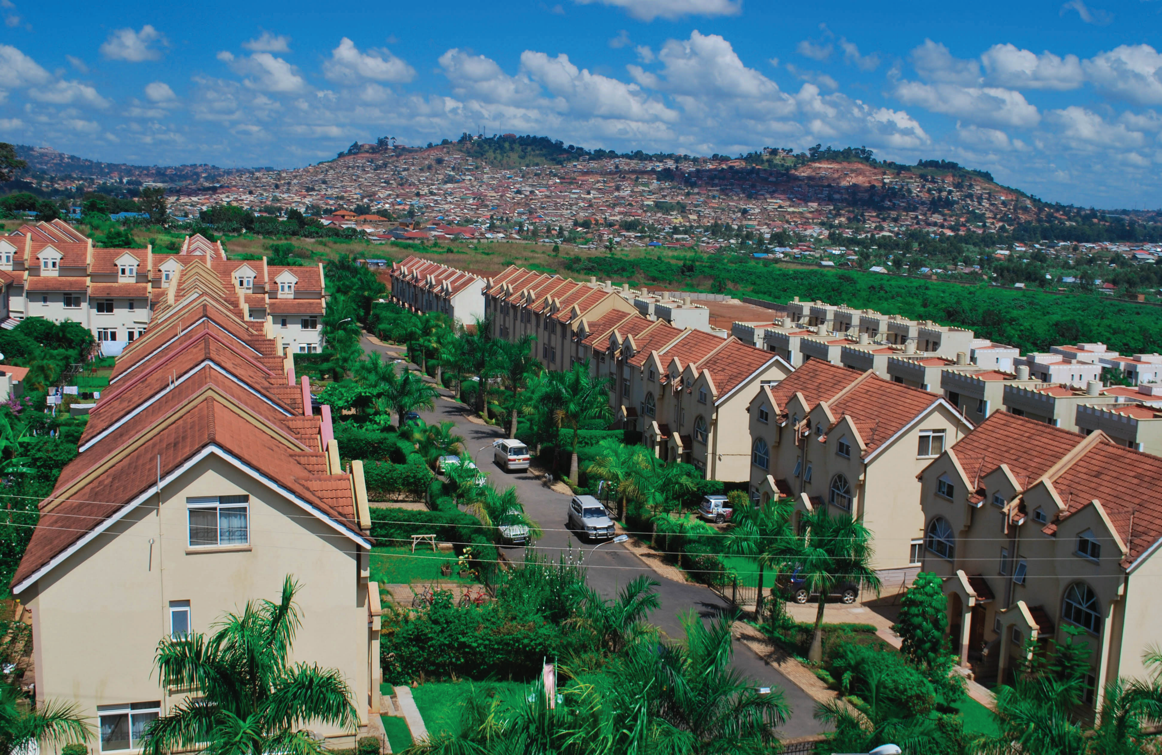
AERIAL VIEW OF ARIES COURT